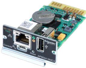
Management card: AP9544