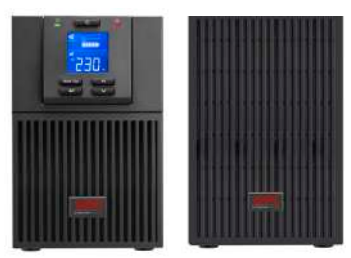
SRVPM2KIL + SRV72BP-9A