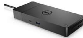
Dell Thunderbolt 4 Dock - WD22TB4

Work from anywhere with this Bluetooth Teams certified headset that lets you switch seamlessly to your PC or smartphone and enjoy crystal clear audio on the go.