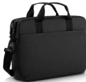
Dell EcoLoop Pro Briefcase - CC5623

Get productive with a quiet, full-size keyboard and mouse combo with programmable shortcuts and 36 months battery life.