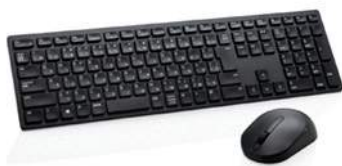
Dell Pro Wireless Keyboard and Mouse - KM5221W

Connect all monitors and peripherals into one device and deliver lightning fast charging with thunderbolt connectivity.