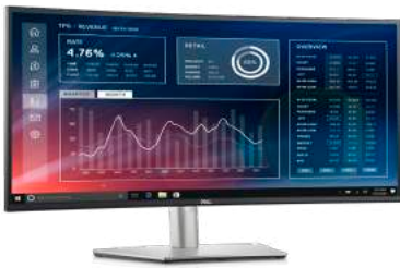
UltraSharp 34 Curved Monitor USB-C Hub - U3423WE

Large Single Display with USB Hub for increased productivity and reduce home office clutter.