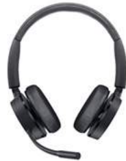
Dell Pro Wireless Headset - WL5022

Large Single Display with USB Hub for increased productivity and reduce home office clutter.