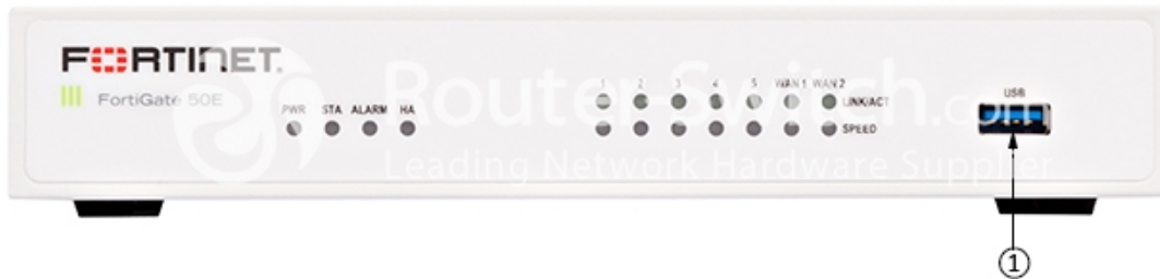
Figure 1 shows the front view of FG-50E. FG-51E is similar with it.