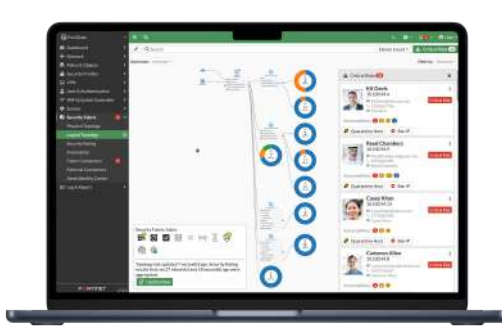
Intuitive easy to use view into the network and endpoint vulnerabilities