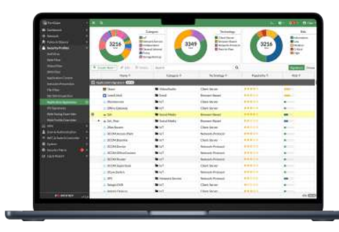
Visibility with FOS Application Signatures