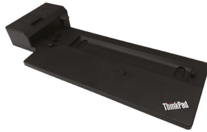
ThinkPad Pro Docking Station