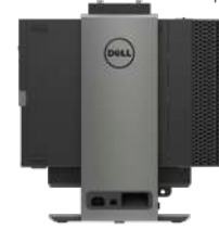
OPTIPLEX SMALL FORM FACTOR ALL-IN-ONE STAND

Small footprint mounting solution adapts to your environment, with cable management and monitor height adjustability, tilt, swivel and pivot functions.