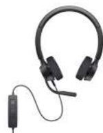
DELL PRO WIRED HEADSET - WH3022 (COMING SOON)

Wired mouse with fingerprint reader offers convenient and secure login and online access without passwords.