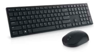
DELL PRO WIRELESS KEYBOARD AND MOUSE - KM5221W

Optimize conference calls and multimedia streaming with exceptional audio clarity. Minimize background noise while on calls with the dual mic array and echo cancellation feature.