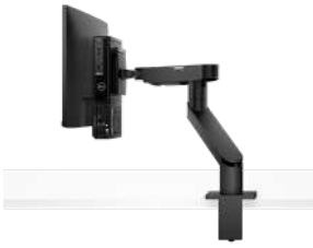
DELL SINGLE MONITOR ARM - MSA20

Maximize your desk space with this sleek arm that supports both system and monitor mounting.