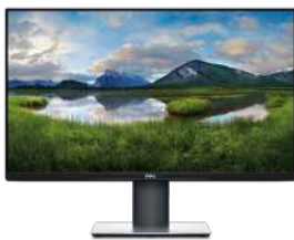
DELL 27 MONITOR | P2720D

See more and do more with a 27" QHD monitor that expands your workspace and gives you a better view of all your important tasks.