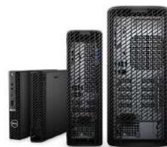
OPTIPLEX CABLE COVERS

Experience exceptional audio clarity with this Teams certified wired headset that allows you to wear the microphone on either side for a customized fit.