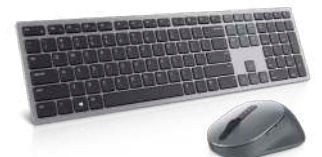
DELL PREMIER MULTI-DEVICE WIRELESS KEYBOARD AND MOUSE | KM7321W

Optimize conference calls and multimedia streaming with exceptional audio clarity. Minimize background noise while on calls with the dual mic array and echo cancellation feature.