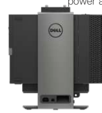
OPTIPLEX SMALL FORM FACTOR ALL-IN-ONE STAND

Minimize your footprint with this arm that offers easy installation and enhanced adjustability while keeping cables neatly hidden from view.