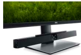
DELL PROFESSIONAL SOUND BAR | AE515M

Take your work to new heights with this 23.8-inch FHD monitor with a wide color coverage. Features ComfortView Plus an always-on built-in low blue light screen, fast connectivity and transfer speeds.