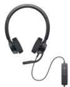
DELL PRO WIRED HEADSET | WH3022

Wired mouse with fingerprint reader offers convenient and secure login and online access without passwords.