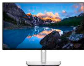
DELL ULTRASHARP 24 MONITOR | U2422H

See more and do more with a 27" QHD monitor that expands your workspace and gives you a better view of all your important tasks.