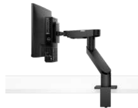
OPTIPLEX MICRO DUAL VESA MOUNT WITH ADAPTER BRACKET

This mount allows the Micro to be VESA mounted to select Dell E Series displays.