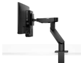
DELL SINGLE MONITOR ARM | MSA20

Mount your system on a wall or under a desk. Includes an adapter box to securely house the system's power adapter.