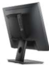
OPTIPLEX MICRO ALL-IN-ONE MOUNT FOR DELL E SERIES MONITORS

Small footprint mounting solution adapts to your environment, with cable management and monitor height adjustability, tilt, swivel and pivot functions.