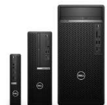
OPTIPLEX DUST FILTERS

Thermally tested custom cable covers offer an easy to install and attractive way to manage cables and secure ports.