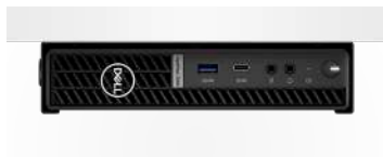
OPTIPLEX MICRO VESA MOUNT WITH ADAPTER BRACKET

Mount your system on a wall or under a surface with a VESA-compatible DVD+/-RW enclosure with full optical drive access. Includes an adapter box to securely house the system's power adapter.