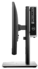
OPTIPLEX MICRO ALL-IN-ONE STAND

Small footprint mounting solution adapts to your environment, with cable management and monitor height adjustability, tilt, swivel and pivot functions.