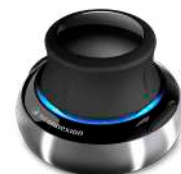
3DCONNEXION ® SPACEMOUSE WIRELESS

With the ambient noise cancellation feature of this wireless headset you can hear every word clearly on your next call.