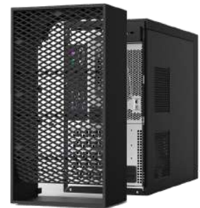
PRECISION MINI-TOWER CABLE COVER

Productivity never looked so good. Achieve more with this immersive 34" curved monitor with wide color coverage and extensive connectivity including RJ45, USB-C and quick access front ports.