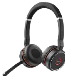
JABRA EVOLVE 75

Safeguard your identity and login instantly without needing to remember complex passwords when you use the Dell Wired Mouse with Fingerprint Reader.