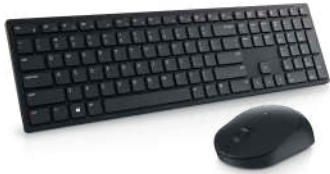
DELL PREMIER WIRELESS KEYBOARD AND MOUSE | KM5221W

Enhance productivity with a comfortable keyboard and a mouse that can scroll on almost any surface (including glass and high gloss). Dual mode connectivity (Bluetooth and USB receiver) allows you to pair up to 3 devices.