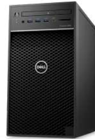
PRECISION MINI-TOWER DUST FILTER

Experience captivating details and true-to-life color reproduction on this brilliant 27" 4K monitor with the widest color coverage in its class 8 .