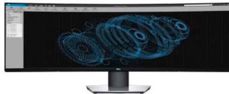
DELL ULTRASHARP 34 CURVED USB-C HUB MONITOR | U3421WE

Optimize your conference calls, multimedia streaming and gaming with this 5W RMS Microsoft ® Skype ® for Business certified soundbar.