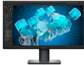
DELL ULTRASHARP 27 4K MONITOR | U2720Q

Enhance productivity with a comfortable keyboard and a mouse that can scroll on almost any surface (including glass and high gloss). Dual mode connectivity (Bluetooth and USB receiver) allows you to pair up to 3 devices.