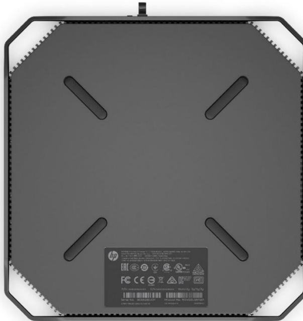
HP Z2 G5 Mini, bottom view

Removable bottom feet for access to integrated VESA mounting holes