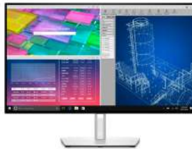
Dell Ultrasharp 27 Monitor - U2722D (x2)

Create phenomenal 4K HDR content on the world's first professional monitor with 2K mini-LED direct backlit dimming zones.*