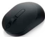
Dell Mobile Wireless Mouse - MS3320W

Collaborate confidently with this 2K QHD webcam that's essential for everyday use.