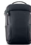
Dell EcoLoop Pro Slim Backpack 15 - CP5724S

Featuring the widest variety of ports available 5 , the compact 7-in-1 Dell USB-C Mobile Adapter - DA310 offers video, network, data connectivity, and up to 90W power pass-through for your laptop 6 .