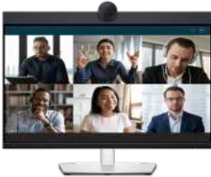
Dell 24 Video Conferencing Monitor - P2424HEB

Experience clear communication with this wireless AI-based noise cancellation headset, designed with a focus on productivity and comfort for all day conferencing.