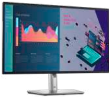
Dell 27 Monitor - P2725H

As the world's #1 monitor company 1 , Dell knows that the modern workplace requires more than PCs. We offer 200+ branded accessories to keep you connected and collaborative no matter your work style. Dell recommended solutions are designed and tested to connect seamlessly with your PC.